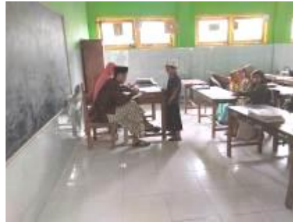
Figure 5. Involvement of Parents as Quranic Recitation Teachers at the TPA (Teaching and Recitation Center)

All students at SDN 1 Wates are Muslims. Recitation of the holy Quran is a priority for the school as a basic skill. Furthermore, TPA activities are carried out to increase students' faith and piety in general, as well as to strengthen their character (Figure 5). In this Teaching and Recitation (TPA) activity, several parents with Islamic religious education backgrounds are involved as Quran teachers. It is held once a week on Fridays from 1:30 PM to 4:00 PM. Parental involvement is expected to make TPA activities more meaningful and impactful for students. The TPA program began in 2004 and consistently involves parents as the teachers.