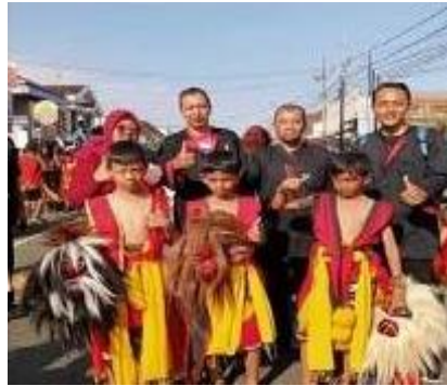
Figure 7. Involvement of parents as traditional dance trainers

Further involvement is in student training for extracurricular regional dances (Figure 7). Ponorogo boasts several regional dances, such as Jathilan, Reog, Warok, Bujangganong, and Klanasewardana (Gunawan & Sulistyoningrum, 2013). Parents of students skilled in traditional dance are involved as trainers, both regularly and occasionally, during annual and special regional events. Wates village also has a Reog Ponorogo artist community, so on several occasions, not only parents are involved, but the community is invited to train students.