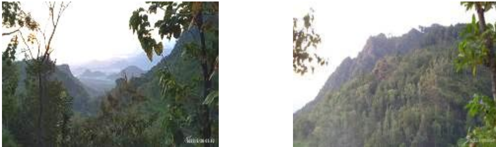
Figure 2. Overview of Wates Village

Figure 1 shows that SDN 1 Wates is located in Wates Village, an area on the border between the Ponorogo Regency and the Pacitan Regency. The area consists of 65% residential areas and agricultural land, while 35% consists of pine and teak forests. Most residents work as rice farmers and field workers, including 55% of the parents at SDN 1 Wates (46 parents). The area is located in the Pringgitan hills (640 m above sea level) and is 40 km from the Ponorogo Regency government center (Figure 2).