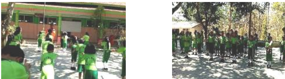
Figure 4. Involvement of Parents as Scout Trainers

Several parents of students at SDN 1 Wates are involved in extracurricular activities in the school. These parents have educational backgrounds that support various extracurricular activities. According to teachers, several extracurricular activities involve parents as trainers, including: (1) scouting training, (2) Al-Quran education park, (3) gamelan art, (4) traditional Ponorogo dance, and (5) routine outbound activities at the end of the year.