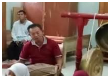
Figure 6. Involvement of parents as gamelan coaches

Ponorogo is renowned for several traditional arts, including gamelan or karawitan (Figure 6). This art form involves playing traditional gamelan instruments using specific procedures and musical patterns to produce harmonious music. With the rapid development of the times, the art of gamelan seems to be marginalized due to the influx of popular music cultures that are popular in society (Qomariyah, 2019). Therefore, the principal of SDN 1 Wates emphasized the importance of teaching gamelan skills to students from an early age. Therefore, an extracurricular gamelan activity is implemented as a manifestation of this effort.