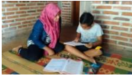
Figure 3. Parental involvement in home learning support

Another form of learning support frequently provided by parents is asking about the difficulties that students experience at school. Parents stated that they often engaged with their students every weekend to discuss their learning progress. The main goal is to ensure student understanding and follow up if students experience difficulties. Teachers and principals also reported that parents frequently communicated with teachers via text messages or directly asked questions about their children's progress. Parents also share which parts of the material their students still do not understand, so they ask teachers to provide reinforcement. Communication between parents and schools is crucial for supporting children's success in school (Garcia & de Guzman, 2020; Sahin, 2019). See Figure 3