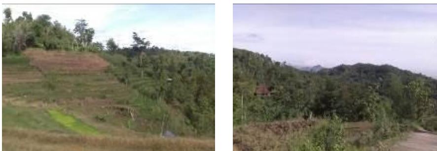
Figure 1. Overview of Wates Village

The research was conducted at SDN 1 Wates, Slahung District, Ponorogo Regency, East Java Province, Wates Village. SDN 1 Wates has a principal, eight teachers, and 84 students. SDN 1 Wates consists of six learning groups, with a single class for each grade level.