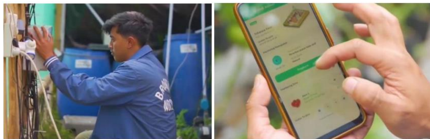
Figure 1. The Lembang Agrotani Farmers Association uses an Automatic Watering System from the Habibi Garden Application

digital farming system was created and technology was used for fertilization, microclimate monitoring, and irrigation systems. One resource person explained, "Based on government and Habibie Gardens guidelines, we have begun implementing an IoT-based irrigation system. The water and time savings are tangible, and everything can be monitored via smartphone." (Uden, Agronative Farm member, 30-year-old). Smart farming tools oriented toward automation systems can improve the efficiency and ease of plant maintenance, especially for high-value agricultural products, such as beef tomatoes and export-quality vegetables. However, the adoption of smart farming remains heterogeneous among certain subjects, influenced by differences in age and experience accessing digital resources. The adoption of smart farming equipment demonstrates how social capital shapes a new habitus for young farmers whose value-oriented structure can assemble local agricultural fields, as conceptualized by Bourdieu (Carolan, 2005). See Figure 1