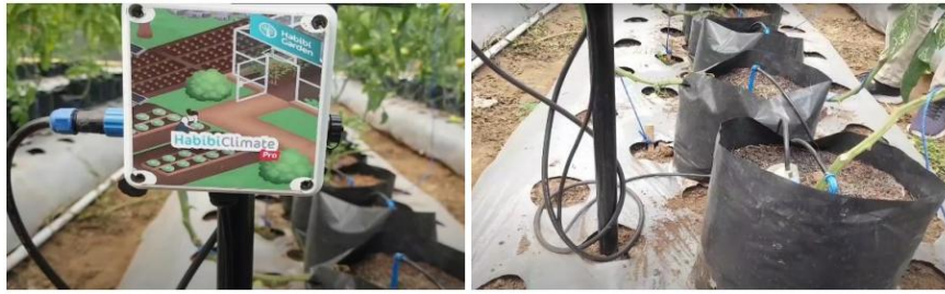
Figure 2. The Makakal Farmers Group utilizes Farming Media & Plant Nutrition Control Tools