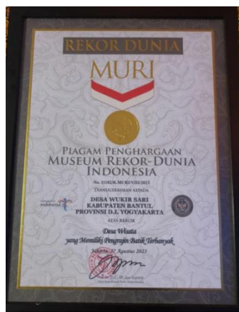
Figure 4. Wukirsari Village Award as a Tourist Village with the Most Batik Artisans in 2023

The MURI record has also been achieved by Wukirsari village as a tourist village with the most batik artisans (see Figure 4).