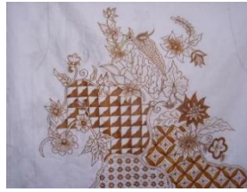
Figure 5. Written batik design

Tourists can also shop at the souvenir center that provides typical products of Wukirsari village, especially batik. To support tourists to be able to enjoy tourist destinations in Wukirsari village, several facilities are provided such as lodging, cafeterias, and culinary centers. The lodging available within the Wukirsari village area are homestay Giri Indah, homestay Sekar Arum, homestay Adi Luhung, homestay Ayodya, and homestay Sido Luhur Sungsang.