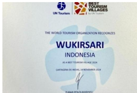
Figure 2. Wukirsari Village Award as the World's Best Tourism in 2024

Various awards were also won in the period 2023-2024, such as pneghargaan as the world's best tourist village in 2024 (see Figure 2).