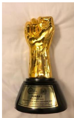
Figure 3. 1st Place Award Cup for Wukirsari Village as the Best Tourism Village in the Advanced Category in 2023

In addition, in 2023 Wukirsari village has also won the ADWI award as the First Winner in the Advanced Tourism Village Category and is included in the 75 best tourist villages in Indonesia out of 4,537 tourist villages throughout Indonesia (see Figure 3).