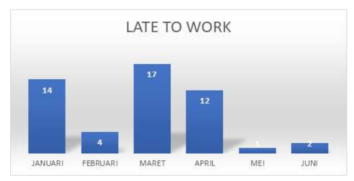
Figure 1. Timeliness Data Source; PT. SAI (2021)

Based on Figure 1. it can be seen that the problems that occur in morale affect employees, seen from the data on delays in the warehouse employees of PT. S AI, totaling 44 people, employees who were late for work in 2021 in January 14 times a month, in February 4 times, in March 17 times, in April 12 employees were late, in May 1 time and in June 2 times. The level of delay is something that needs to be paid attention to, because it is related that work morale affects performance. From these data, it shows that the problem of the level of morale is still low that occurs at PT S AI so that it makes employees lazy to come to the company and results in work not as expected. Morale must be increased at work, because if morale is not increased it will result in a high number of absenteeism in employees which affects the decline in targets set by the company, because work discipline is one of the keys to achieving the company's success in realizing its goals. Work discipline will encourage employee performance within the company, because the company continues to develop and progress, there must be employees who have high discipline. Therefore, work discipline and employee performance are two things that are always related and related. Based on the attendance data at PT. S AI still has employees who are often absent from work.