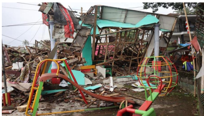
Figure 2. School building severely damaged by the 2022 earthquake in Cugenang, Cianjur Regency, West Java

Disaster education also had significant intergenerational effects. The Intergenerational Spillover Study (2022) found that students receiving disaster education in schools tend to pass on knowledge and skills to their parents and other family members. This process strengthens preparedness at the household and community levels, thereby creating a sustainable chain of disaster awareness. This effect is particularly vital in developing countries, such as Indonesia, where many adults have never received formal disaster education. In this context, schools serve as a critical entry point for building collective societal awareness of risks and emergency responses.