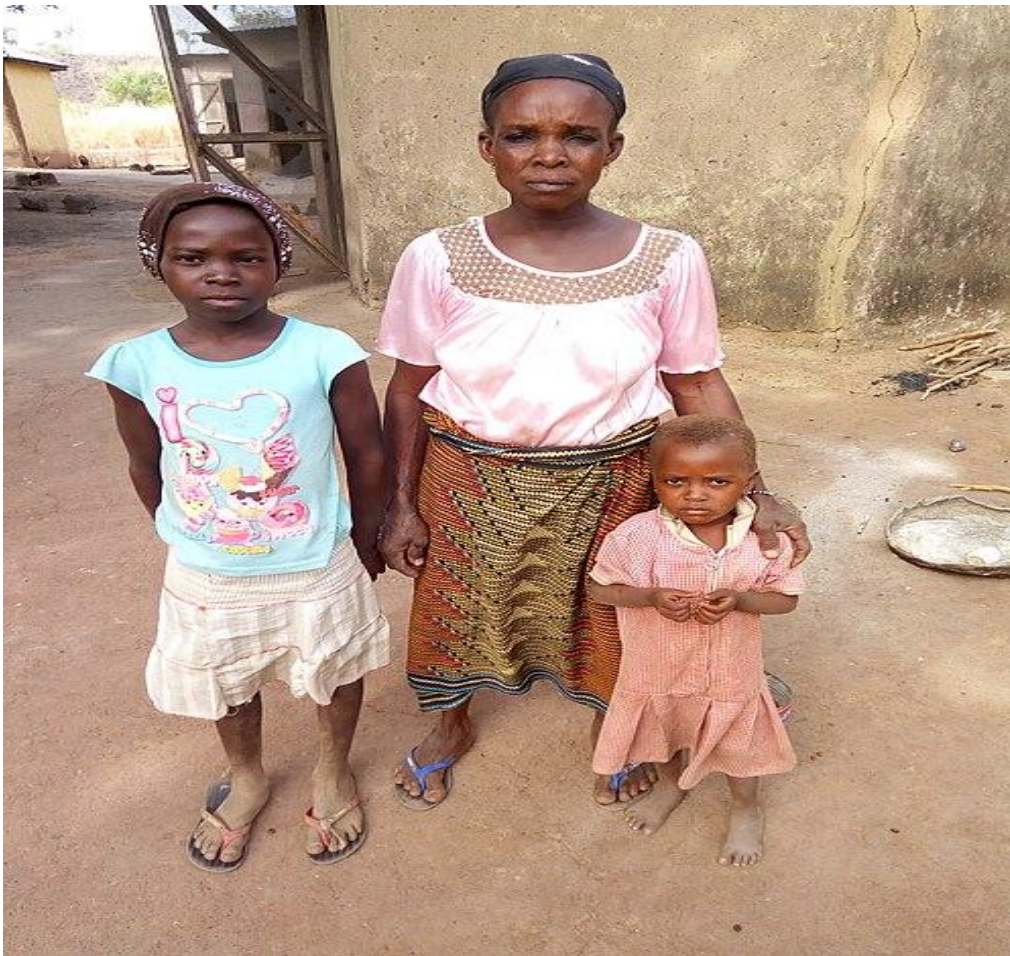
Figure 4. camp resident with her grandchildren at the Tindaanzee witch camp in Kpatinga (Commons, n.d.)

Figure 4). Most accused women bring young family members. These images show how accusations destroy an entire family. Camps may comprise children and orphans, who are looked after by accused women.