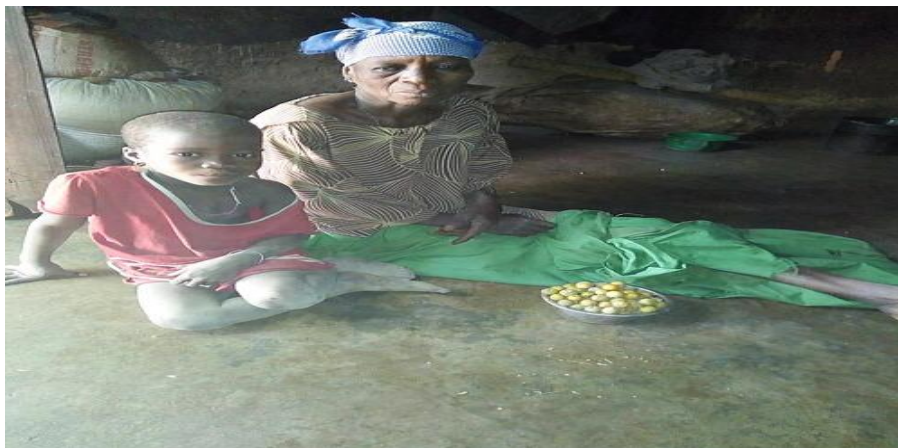
Figure 6 An accused woman and her grandson at the Tindaanzee witch camp. The caption from the photo reads “A blind inmate and her grandson in the Tindaanzee witch camp.”

In Figure 5, our doctrinal and interview examination establishes that Ghanaian law is missing one of the most important mechanisms for safeguarding victims of witchcraft accusations. The proposed amendment would not contravene any superior standards of law; instead, it would plug a loophole. This type of law exists in theory in other nations (e.g., laws against slander and false imputation). Specifically, the Criminal Offences Act has to be a secular instrument; superstition is not a crime, but damaging accusations. Criminalization is, therefore, legally coherent and pragmatically warranted. This Figure 6 exemplifies how Ghana’s most vulnerable (the elderly, disabled, or infirm) can be expelled to camps. This underscores our finding that accused people frequently have serious health issues that require care, yet the stigma of witchcraft deprives them of assistance.