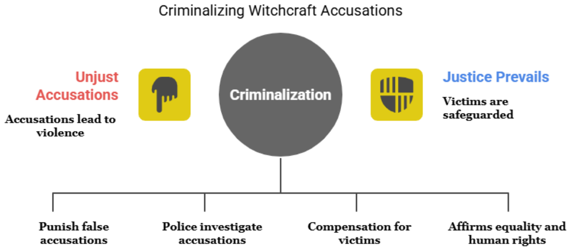
Figure 5. Processed by the Author 05/06/2025

In Figure 5, our doctrinal and interview examination establishes that Ghanaian law is missing one of the most important mechanisms for safeguarding victims of witchcraft accusations. The proposed amendment would not contravene any superior standards of law; instead, it would plug a loophole. This type of law exists in theory in other nations (e.g., laws against slander and false imputation). Specifically, the Criminal Offences Act has to be a secular instrument; superstition is not a crime, but damaging accusations. Criminalization is, therefore, legally coherent and pragmatically warranted. This Figure 6 exemplifies how Ghana’s most vulnerable (the elderly, disabled, or infirm) can be expelled to camps. This underscores our finding that accused people frequently have serious health issues that require care, yet the stigma of witchcraft deprives them of assistance.