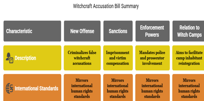
Figure 2. Processed by the Author 07/06/2025

These reforms, although specifically targeted at accusations, mirror international human rights standards. By harmonizing Ghanaian domestic law with the need to safeguard persons from superstitious abuse, the bill would further treat obligations under instruments such as the African Charter (prohibition of discrimination) and the ICCPR (rights to security and dignity). Disallowing unfounded witchcraft accusations can be thought of as analogous to hate speech or incitement offenses elsewhere adapted to the Ghanaian situation (see Figure 2).