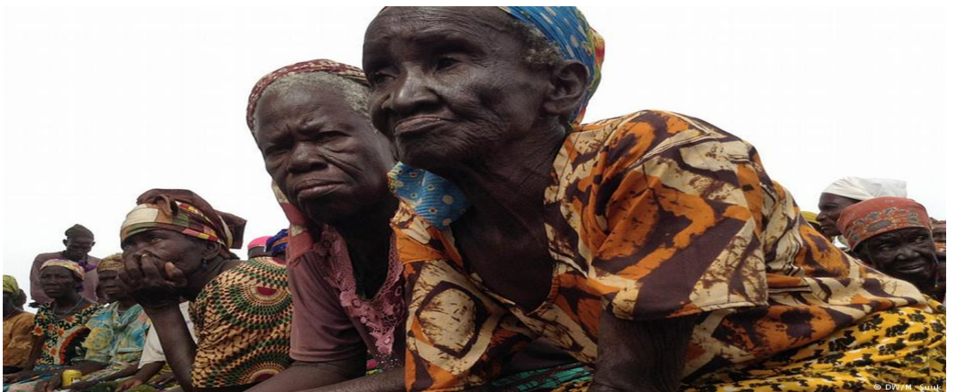
Figure 1. The Birgen Project (Turman, 2020)

The Figure 1 captures an image of the "priests of the earth," who are traditional authorities based on the Tindaanee witch camp in Kpatinga, Ghana. This photo reflects the increasing incorporation of such camps into the overall fabric of local societal experience. In the example at hand, a community figure acting as a priest holds a certain amount of authority over the camp, even as it persists in economic hardship for the population.