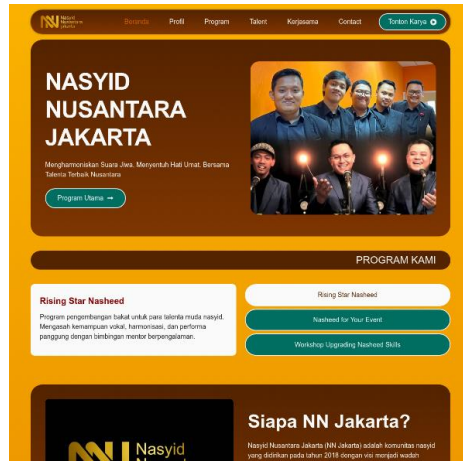
Figure 3. Example of the Nasyid Jakarta website interface display