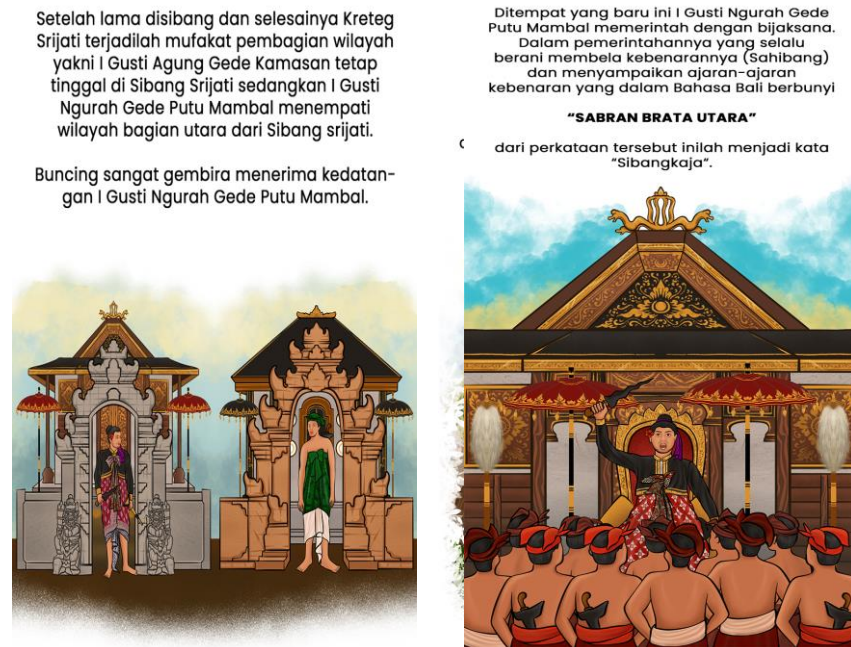
Figure 3. The Sibangkaja Village history story panel is website-based

Figure 2 presents data from 92 young respondents in Sibangkaja regarding their level of understanding of the village's history through the website. The survey results indicate that 93.5% of participants perceived the web-based visual narrative format as "easier to understand." The collaborative processes embedded within the DBR approach enabled an accurate representation of customary values while also being regarded as an effective digital platform for village cultural archiving. Accordingly, the application of DBR within a digital humanities framework demonstrates its capacity to produce culturally accurate, user-oriented, and community-relevant media designs for customary villages.