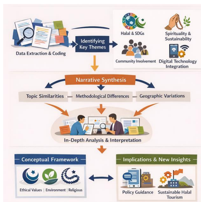
Figure 2. Data Analysis Stage

The data analysis technique (Figure 2) in this study combined thematic analysis with narrative categorization. After extracting data from the articles, coding was conducted to identify key recurring themes, such as the link between halal tourism and the SDGs, spiritual dimension of sustainability, role of local communities, integration of digital technology, and inclusive destination governance models. This analysis technique draws on a narrative synthesis approach, which allows researchers to group articles based on topical similarities, methodological differences, and variations in the geographic context. Each theme was analyzed in depth to identify the unique contributions of each study and how the findings enrich the understanding of halal tourism practices and theory. In the final stage, the results of this thematic analysis were used to formulate a conceptual framework for the integration of ethical, environmental, and religious values in the development of sustainable halal tourism. The entire analysis process was conducted manually but systematically to ensure the accuracy and validity of the research results.