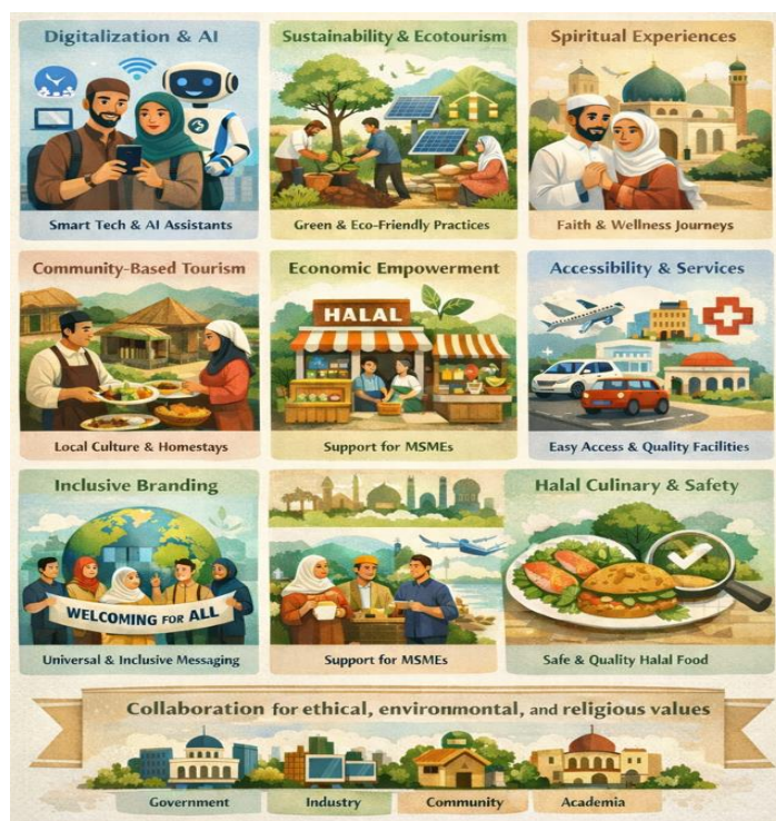
Figure 3. Halal tourism infographic overview

In terms of tourist behavior, studies such as those by Abror et al. (2025) and Aimon et al. (2023) show that halal tourist satisfaction and loyalty are determined not only by facilities but also by emotional, spiritual experiences, and perceived psychological safety. This encourages the need for an experience- and value-based approach in designing destination services. Research by Hanafiah, Hasan, and Mat Som (2022) shows differences in preferences between conservative and flexible Muslim tourists, necessitating a lifestyle-based service segmentation strategy. A similar finding was made by Pongsakornrungrungsilp et al. (2024) using the AIO (Activities, Interests, Opinions) framework, which divides Muslim tourists into three behavioral segments. See Figure 3